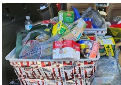
Attendees contributed 97 pounds of food to the Chattanooga Area Foodbank.